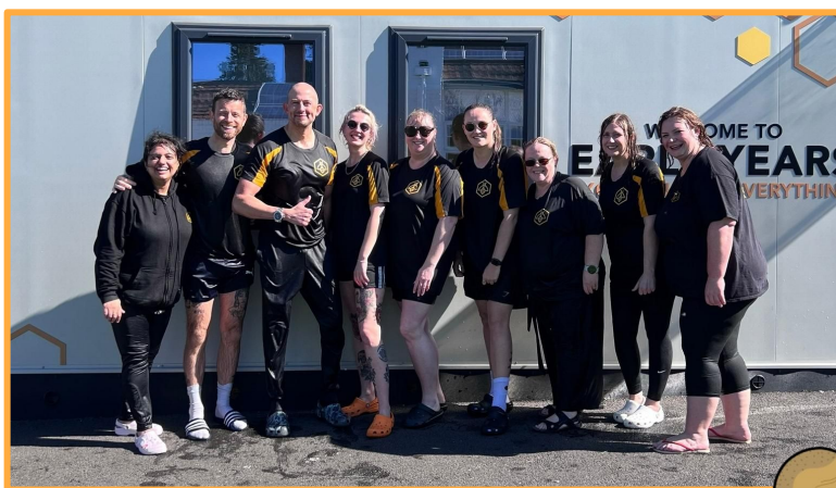
Make it a great weekend